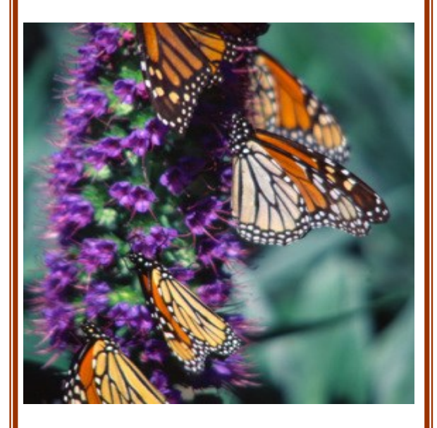
Text for the Week

"Beloved, I wish above all things that thou mayest prosper and be in health, even as thy soul."